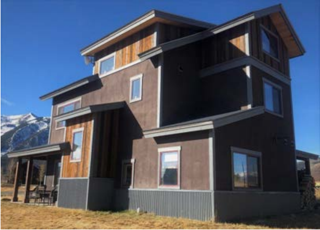
This home is a good example of trim boards on a predominantly stucco finished home